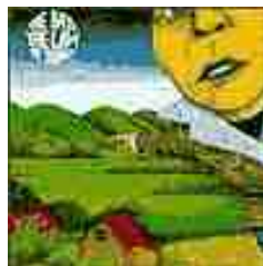
The Law Of Things 1989