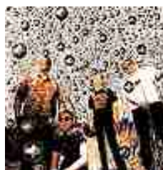
1000's of Tiny Luminous Spheres 2000