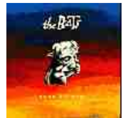
Fear Of God 1991