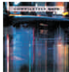
Completely Bats 1990