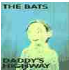
Daddy's Highway 1987